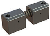
Opening damper FD115